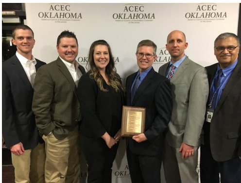
Honor Award C P & Y, Inc. Hefner Water Treatment Plant Sludge Handling Facility