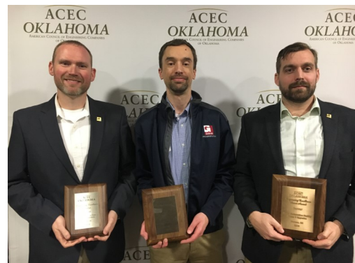
Finalist Awards Garver Camp Gruber Fire/Emergency Services Report and Pig Farm Road Low Water Crossing Improvements