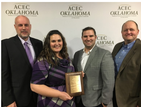
Honor Award Guy Engineering Services West 81st Street South