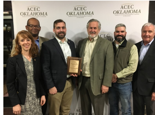
Honor Award Garver Water Reclamation Facility Phase 2 Upgrades