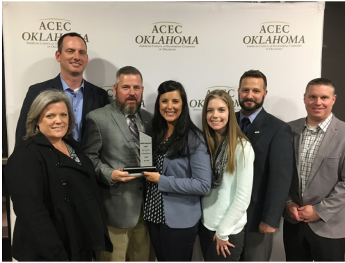
Grand Conceptor Award HNTB Corporation Riverside Drive at Gathering Place