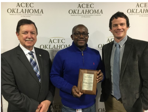
Finalist Award MacArthur Associated Consultants Iowa/Dakota Residential Streets Improvements