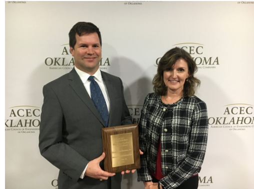
Honor Award Freese and Nichols Edmond Elevated Storage Tank