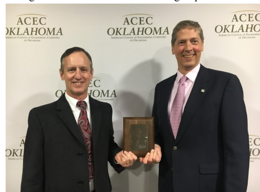
Finalist Award MacArthur Associated Consultants SkyWest Airlines Maintenance Facility